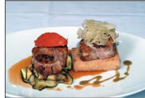
Medallions of Veal "Provencale" with grilled zucchini, fennel panisse, and herbes de Provence.