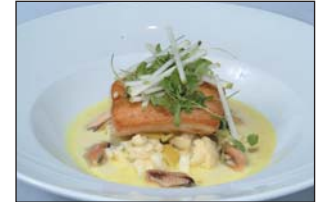
Local Mahi-Mahi with cauliflower, apple and mussel cocotte and West Indian Colombo spices.