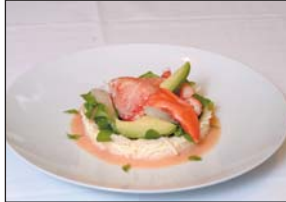
Chilled Lobster Salad with baby lettuces, fennel, pomelo, avocado, basil and citrus vinaigrette.