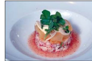
Peekytoe Crab Salad pickled gold pineapple, watercress and coriander vinaigrette.