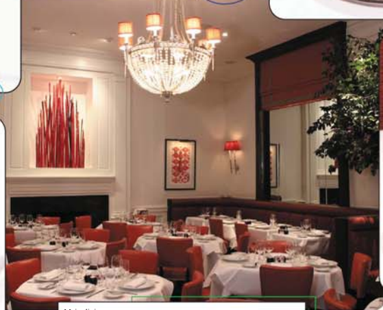
Main dining room