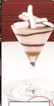
Butterscotch panna cotta