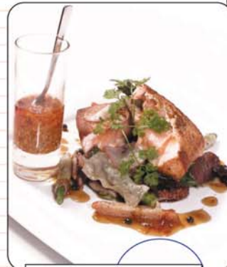
Wild salmon with Asian spices