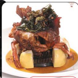
Crisp and angry lobster