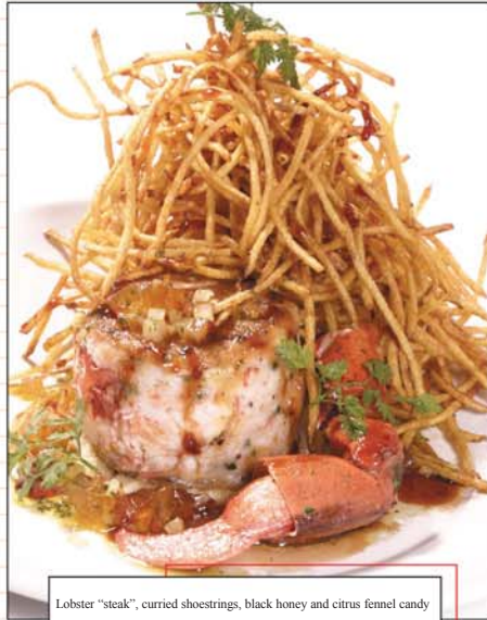
Lobster "steak", curried shoestrings, black honey and citrus fennel candy

Main course selections included hand-roasted ginger rubbed salmon glazed with hot and sour Oriental sauce. It comes on a bed of compelling Chinese sausage, mustard greens and octopus slices, sided by red pickled kimchee cabbage. Pan roasted, semi-boneless Dover sole lightly coated in seasoned flour and brushed with a fine tomato mint butter is paired with somewhat heavy sourdough gnocchi