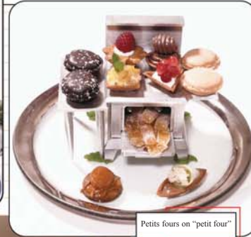
Petits fours on "petit four"