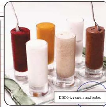
DBD6-ice cream and sorbet