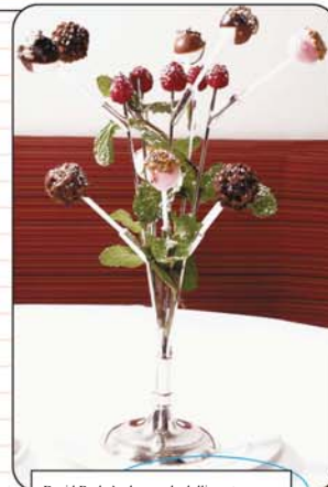
David Burke's cheesecake lollipop tree

*** David Burke & Donatella, 133 East 61st Street (bet. Park & Lexington), New York. (212) 813-2121. Lunch and dinner daily. Dinner entrees $24 to $38. Prix fixe tasting menu is $65 per person. Accepts reservations and major credit cards. BT